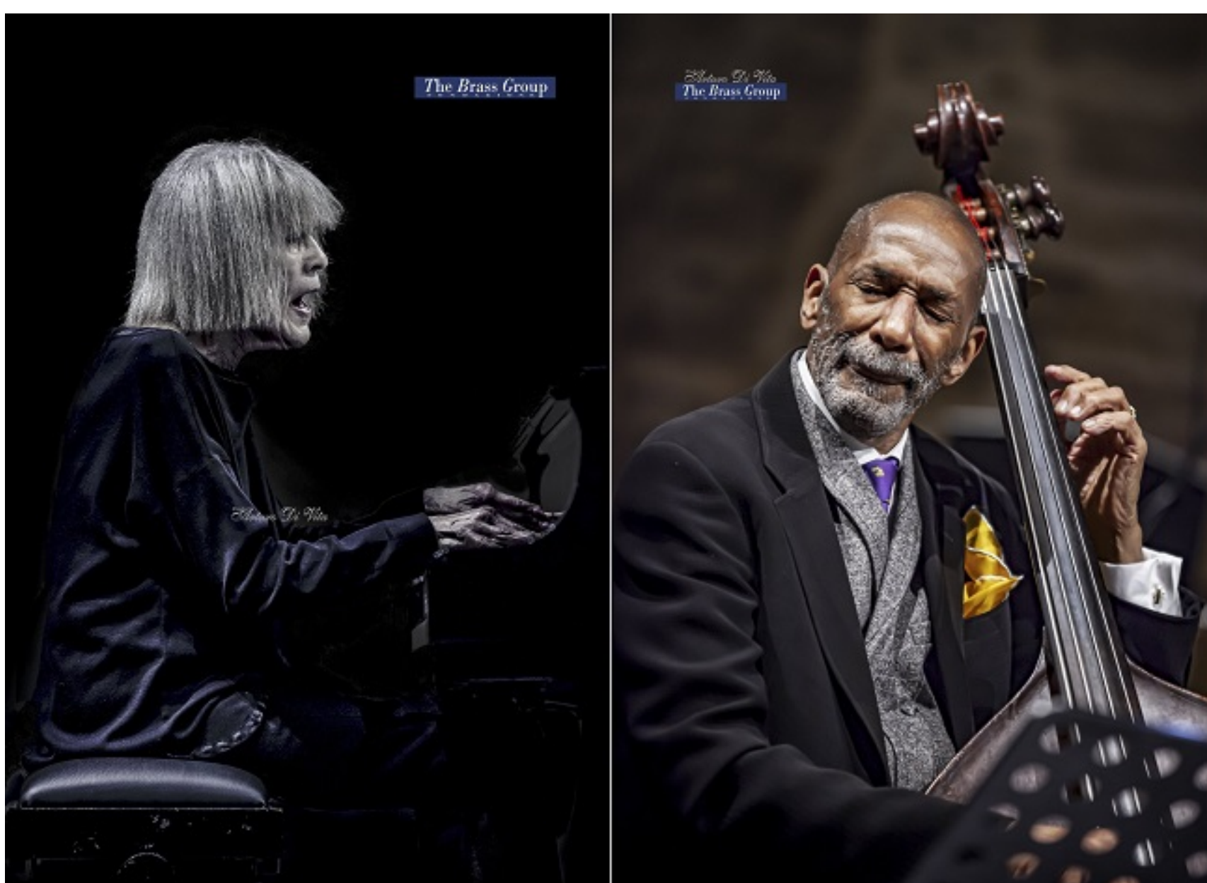
(Carla Bley & Ron Carter /)