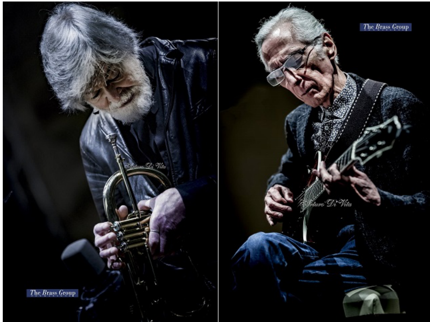
"All of them have been fundamental moments, from the greatest jazz musicians in the world to the students of the jazz school. Each one has given me a part of a universal vocabulary that unites all the musicians of the world in musical interpretation..." (Tom Harrel & Pat Martino /)

Music is my soundtrack... Each period has had its music linked to memories that are rekindled when listening to a certain song. When I photograph a musician, I feel a deep joy if I can capture his most intense creative act.